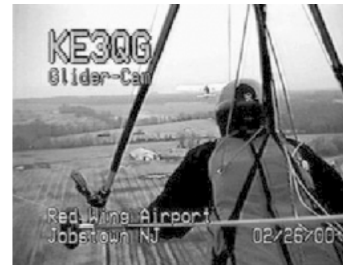
ATV from a hang glider

Amateur Television is fun and can be inexpensive. But like any part of the ham radio hobby, you can spend about as much as you care to. There is always that other piece of equipment that will make the TV Station Ham Shack really neat. So you can start small and grow as the $$$ permit.