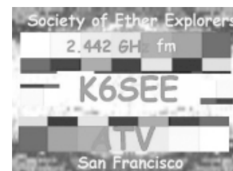
ID screen of San Francisco ATV Repeater

Your best source of information about ATV is Amateur Television Quarterly, as the publication is devoted entirely to ATV, SSTV, and projects. ATVQ contains an assortment of articles and features covering technical topics in both the beginner and advanced flavor, build it projects, station