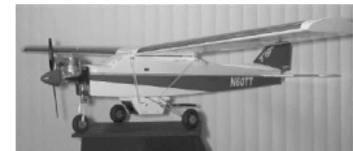
R/C control plane with ATV camera

Portable and mobile operation are easy, just do not watch ATV while you are driving! Ham TV operators have found how easy and fun it is to operate in a variety of ways including hot air balloons, helium balloons, kites, cars, trucks, trains, planes, gliders, back packs, canoes, boats, ships, mountain tops, and ATV Repeaters. Seeing DX from a 1-watt transmitter at 110,000 feet up in the air will allow stations to see live video from a camera hung under a helium balloon for up to 500 miles in any direction. Many Hams are using