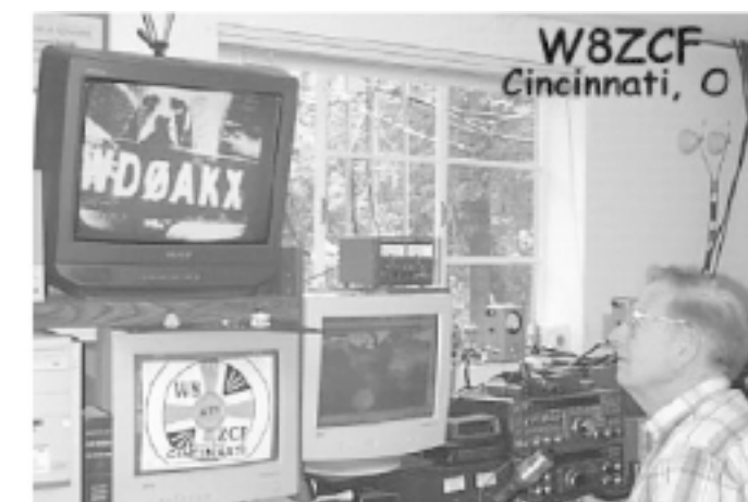
W8ZCF working DX with ATV

Amateur Television is REAL LIVE TV! Just like the television that you watch on your TV at home, you can make your own broadcasts to other hams, to show off your ham shack, your latest project that you have built, your beautiful wife (handsome husband), your puppy doing tricks, or just about anything, within the ham radio rules and regulations that you might want to broadcast. One of the special items that we can do as hams is to rebroadcast the NASA channel that is available on "C" band satellite receivers as a free program, and also now available on some of the smaller dish services as well.