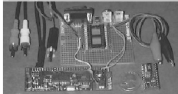
Using the Basic Stamp with ATV

So ATV is a lot of fun. All you need is your Ham License and the desire to have fun. The following pages will give you a little more insight on how to get started.