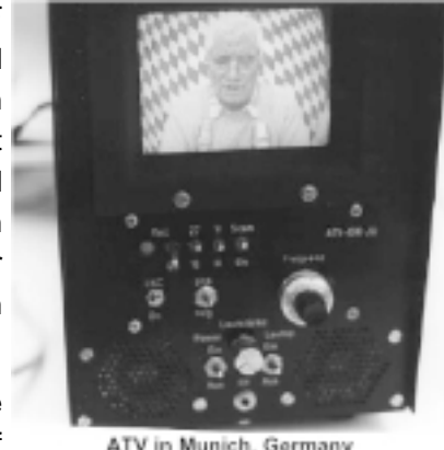
ATV in Munich, Germany

such as CQ-TV, VHF Communications, and Der TV Amateur (in German only). The first two can be subscribed to through Harlan Technologies for your convenience or through their web site.