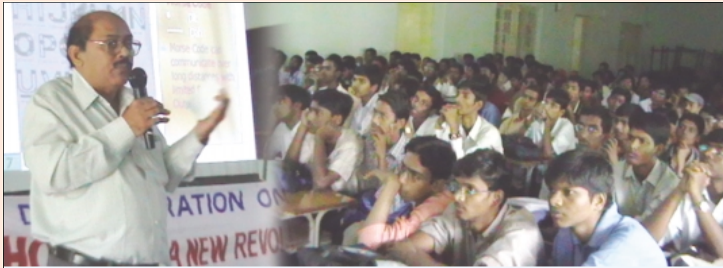
Students of Govt. Polytechnic College, Masab Tank Hyderabad participating in the Awareness Program conducted by NIAR.