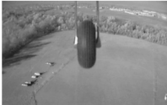
View of landing area from R/C airplane

copies are still available from 1994 to present. ATVQ is also available on CD-ROM in Acrobat PDF format, so even the older issues can still be acquired. We keep an index of all articles from day one on our web site, http://www.hampubs.com , so if you are looking for a special subject you can search for it very easily. We do not provide this in paper form as it is around 80 pages of information.